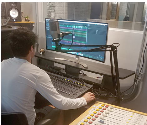
HHS New Audio Engineering Lab

Students were welcomed back to school on August 14th to some changes and upgrades to accommodate growing enrollment and enhance security features including, band room upgrades, a new security vestibule and changes in the cafeteria. In addition, Mr. Poff's Mass Communications Suite added a new Audio Engineering Lab where students have the opportunity to record audio for film projects, rehearse speeches and hopefully a new HHS radio station!