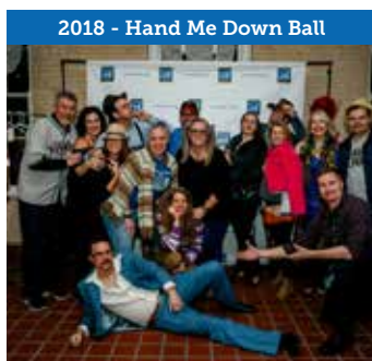
2018 - Hand Me Down Ball