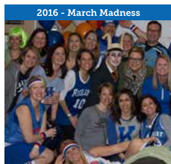
2016 - March Madness