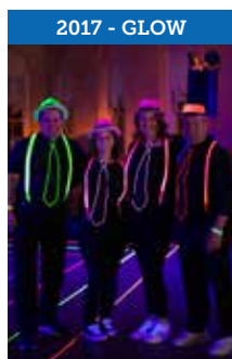
2017 - GLOW